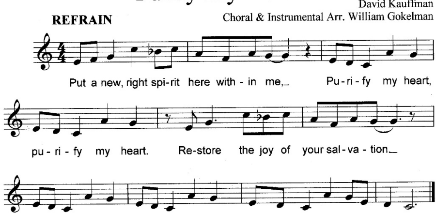
Pu-ri-fy my heart, pu-ri-fy my heart, Wash me Lord and I will be clean.