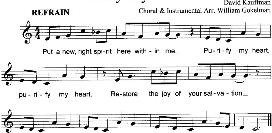
Pu-ri-fy my heart, pu-ri-fy my heart, Wash me Lord and I will be clean.