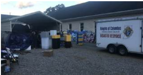
Flatbed trucks bringing supplies for teams to use and/or distribute. Our Knights work assembly area.