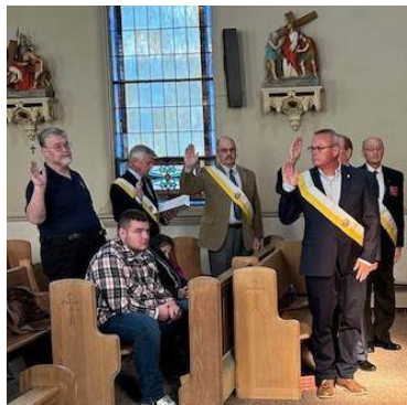
Exemplification Team renewing promises