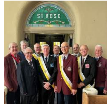
Exemplification team and State Officers