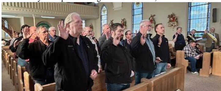
New members promising to uphold our laws