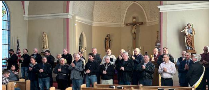
Newly exemplified Knights of Columbus, Council 10444