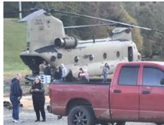
One of the Disaster Relief Supply points.