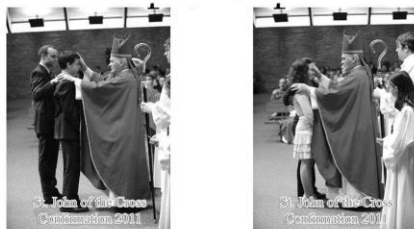
Stand behind the Confirmandi not next to the Confirmandi

Tom Killoran Photography Instant Event Photos 11316 S. Harlem Ave. Worth, Illinois 60482 708.361.0025