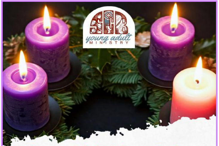
Young Adult Advent Series 7:15pm on Monday, December 2, 9, 16 & 23 Info & Sign-up www.stcharlesfortwayne.org/YA